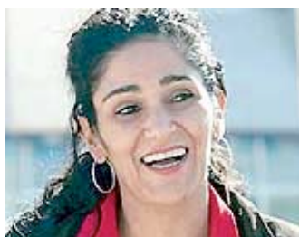
Mexican Journalist Stands Up to the Traffickers